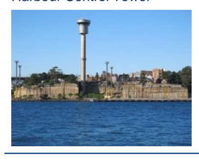
Harbour Control Tower

Procurement & Probity Advisor for tender of operator for Jenolan Caves Commercial Businesses